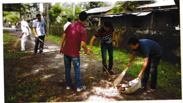
Observation of Swachh Day on 12th September, 2016 by the teaching and office staff of Bihpuria College.