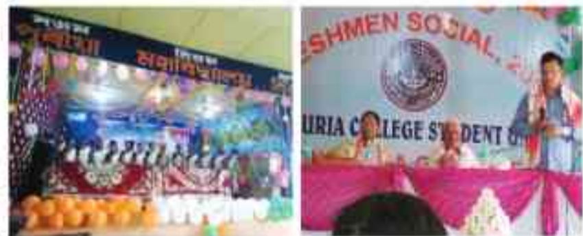
Freshmen Social 04-09-2019