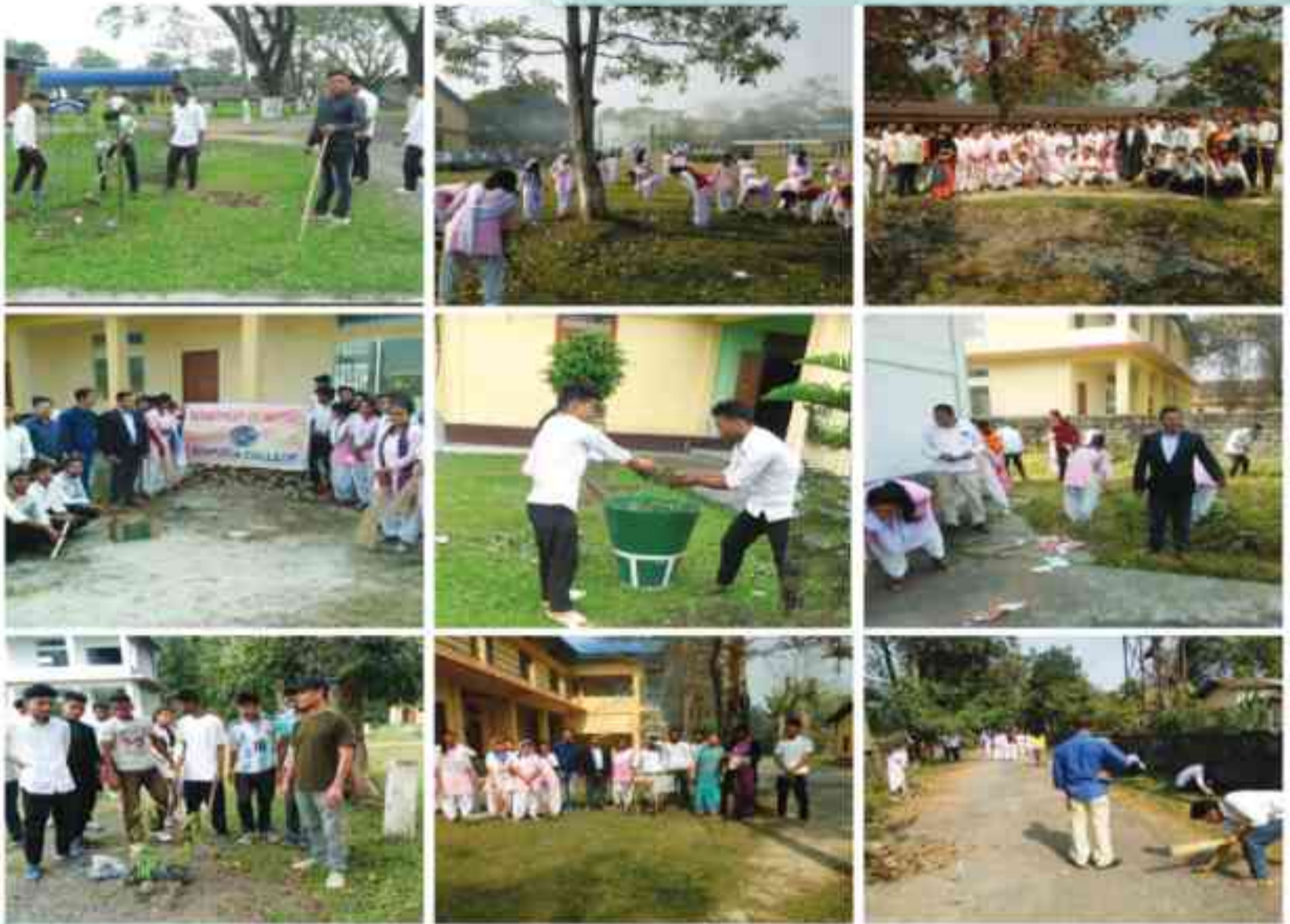
Cleanliness Drive Competition among the students of the Departments