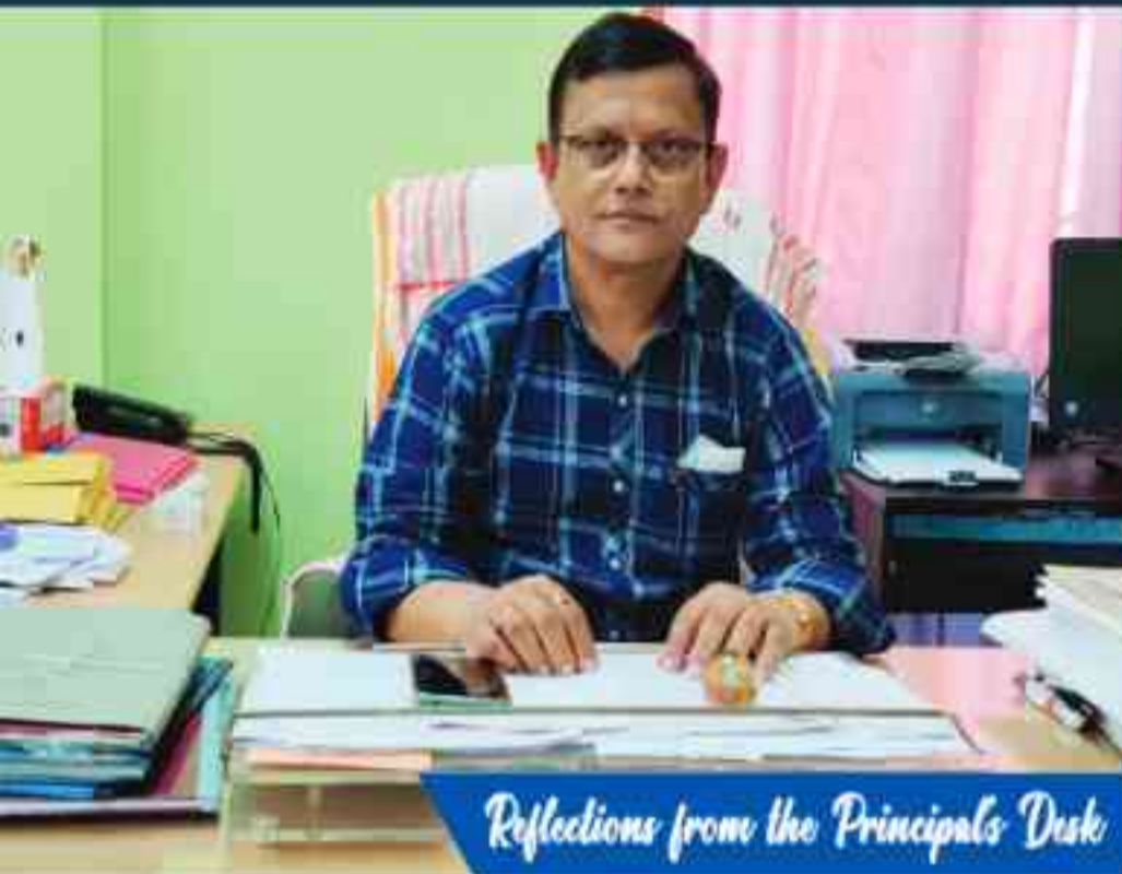
Reflections from the Principal's Desk

Bihpuria College, Bihpuria, Lakhimpur, Assam