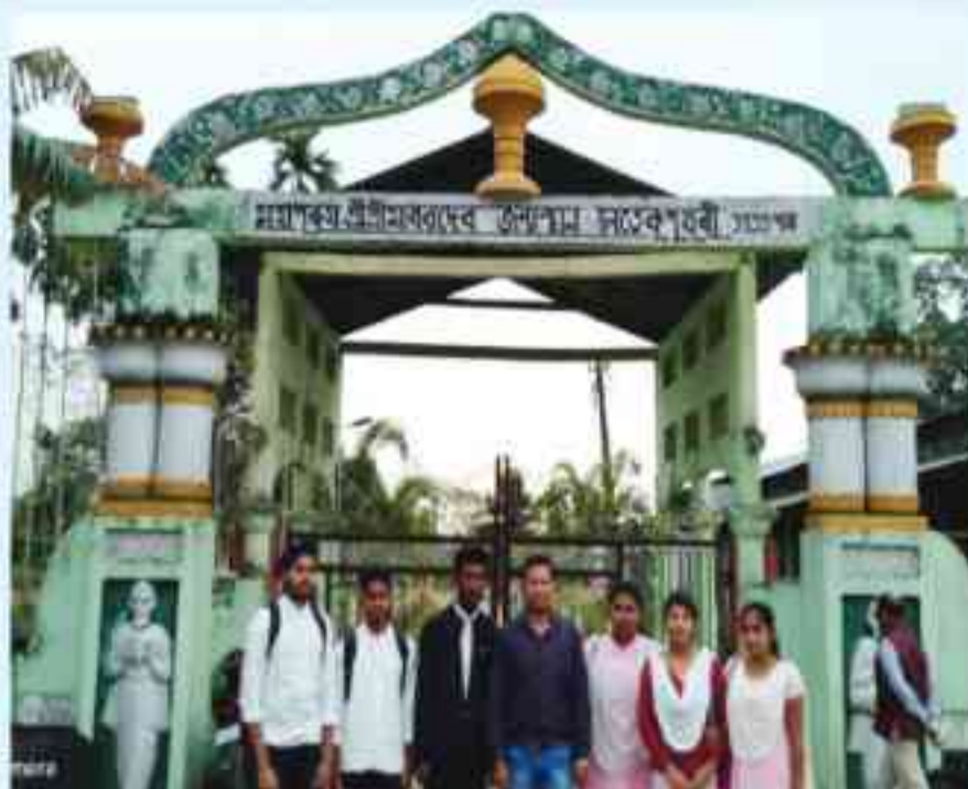
The Department of History visited Letekupukhuri Than on 04.04.2019