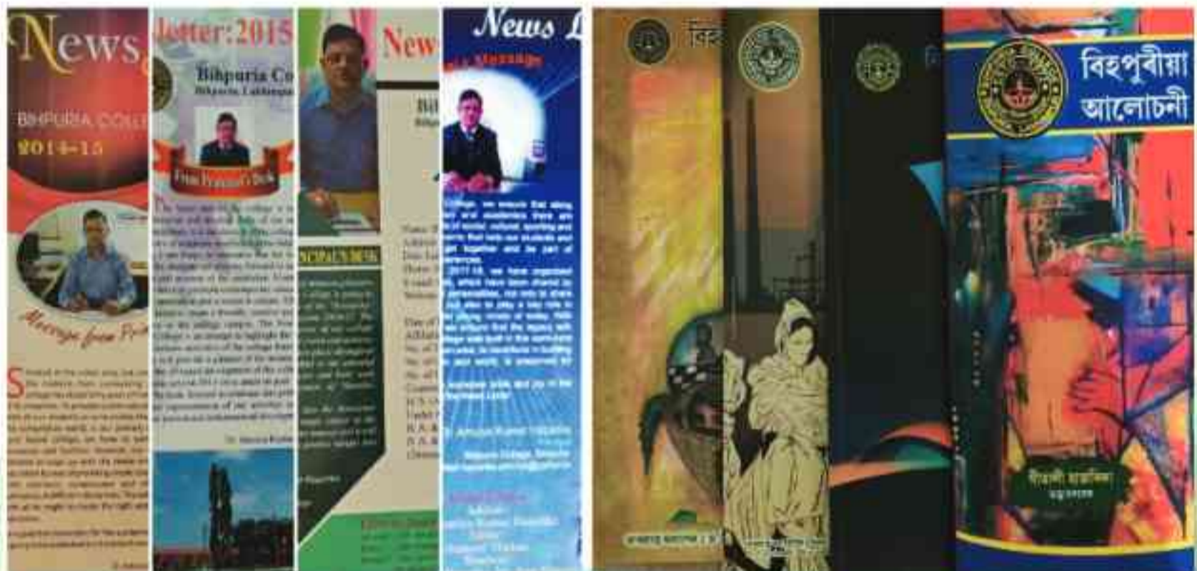
Newsletters published in the previous years

On 18 th August 2019, a few representatives of Teachers unit Bihpuria College along with the Executive members of Assam College Teachers' Association (ACTA) Lakhimpur Zone visited the flood affected area of Homora, Bahgora . The representative members, offered some edibles and other stuff to the victims.