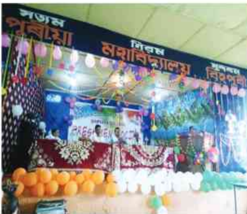
Freshmen Social 25-08-2018