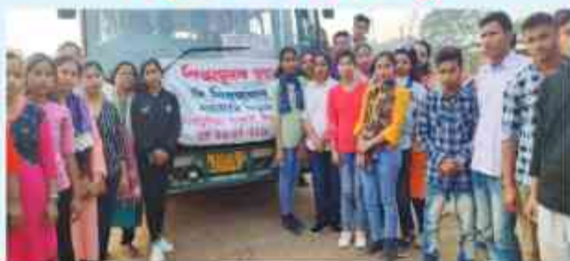
The Department of Sociology conducted an educational tour to Sivasagar on 16.02.20.