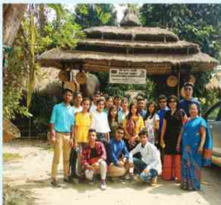
The Department of Geography organized an educational tour to Dibrugarh University on 23.03.2019